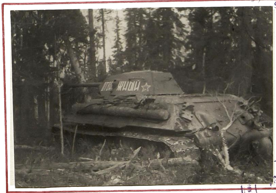
Tank T-34 paves the road in the forest area square 5486.

Without the help of tanks, it was impossible to lay passages, since making a clearing in the overgrown forests and cleaning up these forests with detachments of infantry and sappers, as well as clearing passages in hard-to-pass natural blockages, all this took time and threatened with untimely fulfillment of the assigned task. In this case, the tanks, moving ahead of the advance vanguards of the rifle division, knocking down trees and breaking rubble, formed a kind of flooring for the road.