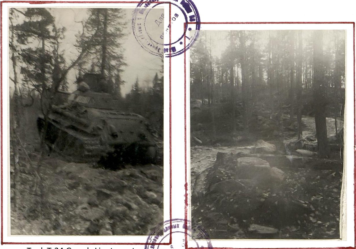
Tank T-34 Guards Lieutenant KUKHARENKO overcomes the rise of stone soil in the area of the sq. 5628.