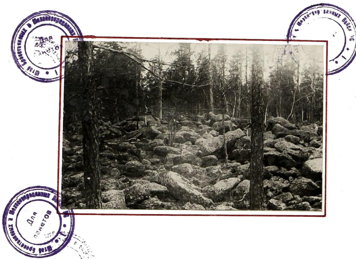
Terrain on the brigade's movement in the area of sq. 5480.

The brigade made a march of 160 km., in conditions of extremely difficult terrain in the polar Karelia, of which about 60 km. off roads, along the column road, which was laid by the tanks themselves through the mountains with the presence of continuous boulders through forests and peat bogs.