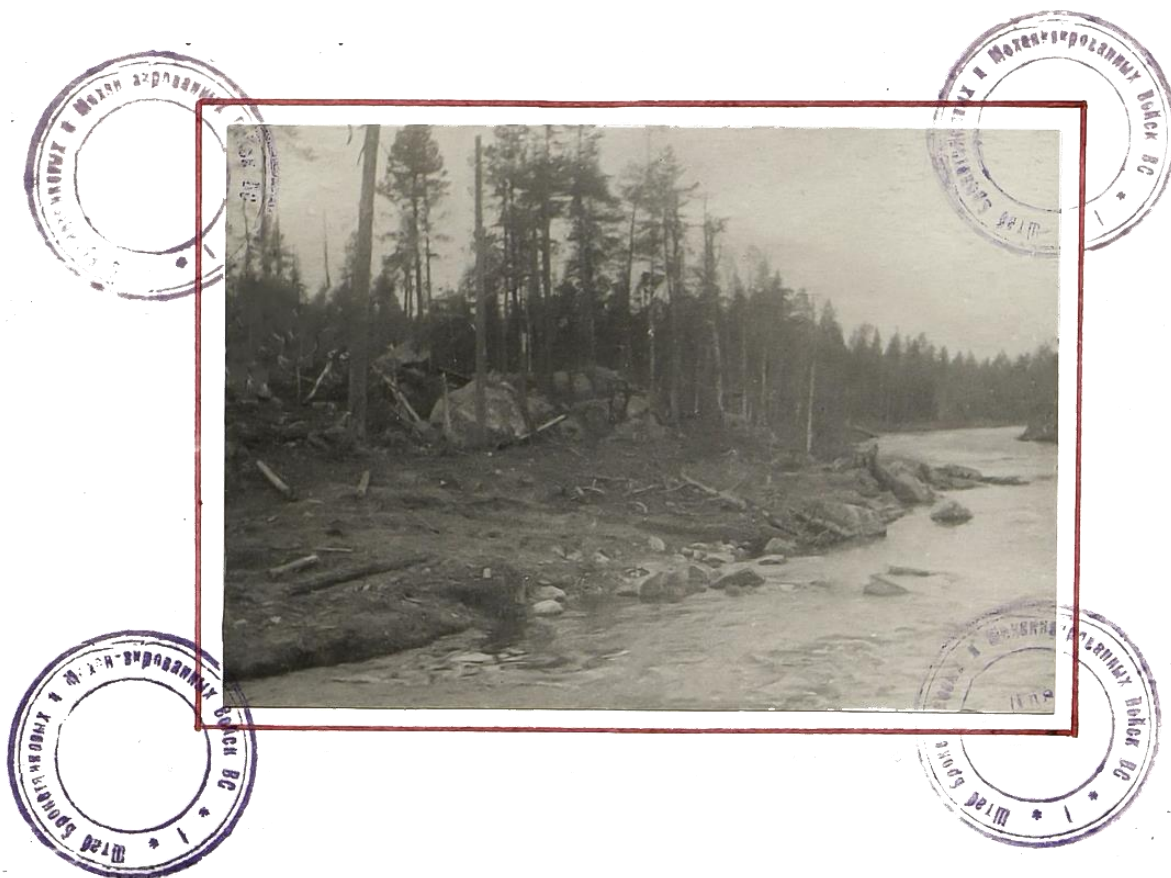
Photo. Left bank of TUN TSA River.

The rivers of the region can be classified as semi-mountain rivers with many cracks and sills. All rivers in summertime are passable on rifts and rapids. The bottom of the rivers is rocky, the flow is fast, 1.5-2 m/s.