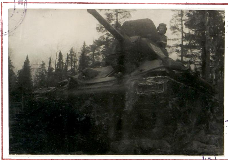
T-34 tank movement on a rocky ground in the area of sq.5424.

With the vanguard from another rifle division to pave the second path for the troops of the rifle division, this platoon, after completing its mission, connected for crossing the river TUN TSA with a platoon of Guards Captain MELNIKOV