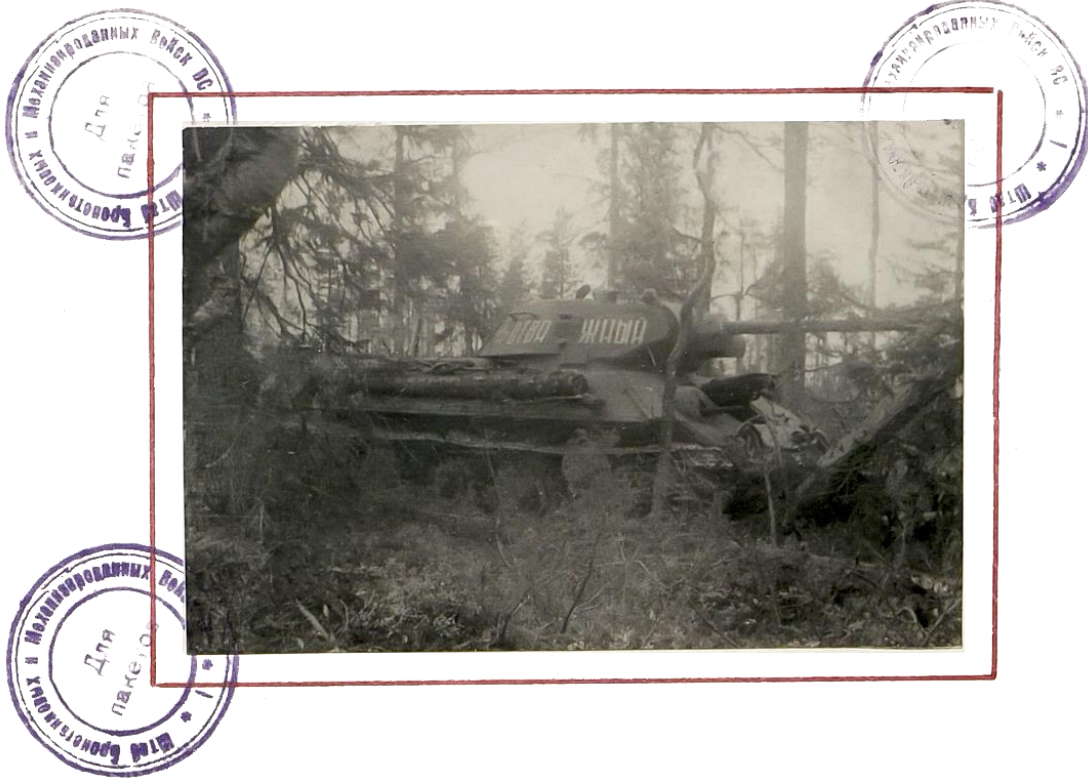
T-34 tank paves the road in the forest in the area of sq. 5482.

Going behind the infantry, it only remained to level and pull off the interfering dumped trees. Such advancement enabled rifle units to advance with convoys after tanks along the road they laid. In addition, as mentioned above, the presence of a thick network of marshes and the weakness of the soil did not allow the movement of tanks on one track without increasing the terrain with wood flooring. Thus, although all parts of the rifle division passed behind the vanguard, with separate groups of horse-drawn vehicles, the main forces of the brigade could not go along the laid route without proper preparation / arrangement of crossings over water lines, without strengthening the terrain with wood flooring /. The brigade did not have a sufficient number of sappers, and the infantry did not have them at all. The staff of the brigade, on its own, built itself all the way with wooden floorings and water crossings, casting logs, rocky rapids. They built over 6 wood floorings with a total length of 200-400m. Each log is more than 25 cm thick.