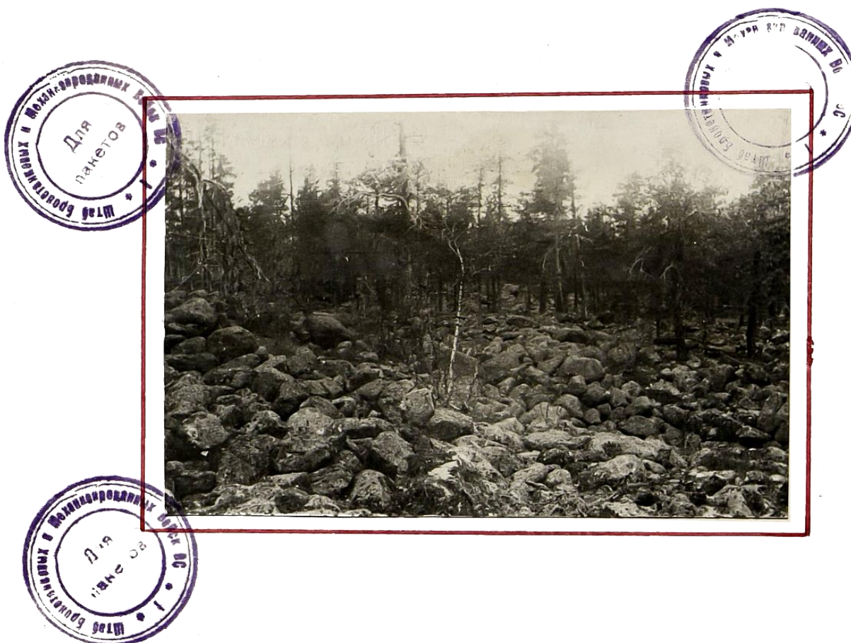
The area in the area of square 5626.

The relief of this area is a continuation of the spurs of the Scandinavian mountains and has a mountain-knoll-like character. There are rocks and boulders scattered all over the area, reaching huge sizes, in some places, making up a heap of boulders, not overcome by transport and difficult to overcome by infantry.