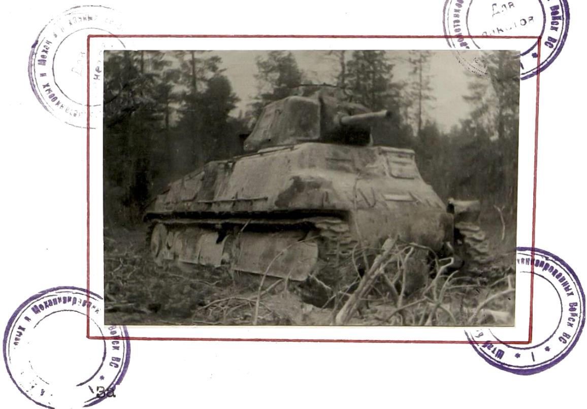
Photo. Captured serviceable German tank "Somua" in the area of sq. 4816.

Personally, Comrade KUKHARENKO himself destroyed 3 tanks and captured 2 enemy tanks in good repair, thereby ensuring the overall success of the advance of the 1st and infantry 217th rifle Regiment, 104th rifle Division.